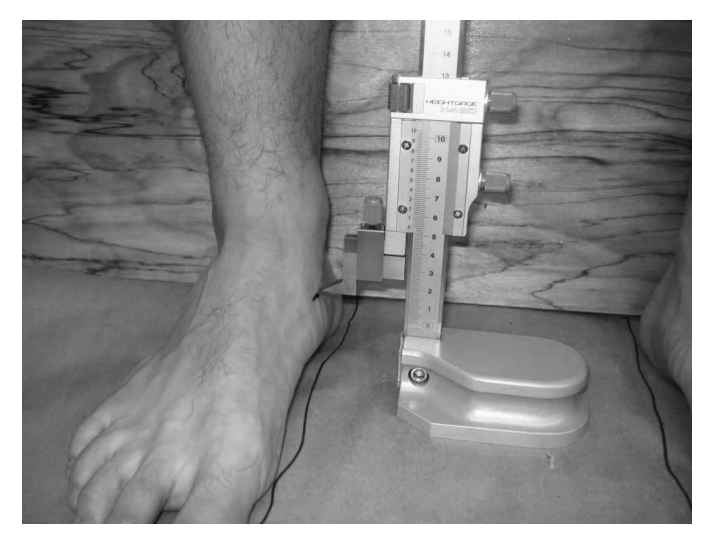
Figure 1. Navicular-height caliper measuring from the floor to the marked navicular tuberosity.

Twenty-five individuals (13 men, 12 women; age = 20.0 \pm 1.0 years, height = 172.3 \pm 6.6 cm, mass = 70.1 \pm 10.2 kg) from a college-aged population volunteered for this study. All participants met the inclusion criteria of having a navicular drop of more than 8 mm (12.9 \pm 3.3 mm). Mueller et al<sup>18</sup> measured healthy individuals and reported a mean navicular drop of approximately 7 mm for the right foot. Therefore, we used 8 mm to reflect a sample with some degree of overpronation that could be affected by the use of a taping technique. Participants had no reported history of substantial lower body injury in the 6 months before the study that would affect gait and no acute injury, such as a sprain or strain. An acute injury was defined as any injury that currently caused symptoms of pain, swelling, or reduced function. Participants were also physically active, which was defined as performing 30 minutes of cardiovascular exercise at least 2 days per week to ensure that they could complete the testing protocol. All participants provided written informed consent, and the